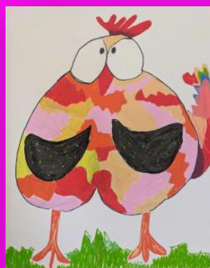
Ms Hingston-Coffee $100