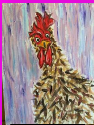
Ms Carnegie $100